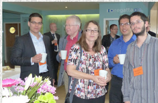
Delegates at Computational Modelling '15

The conference is organized by Minerals Engineering International (MEI). Since their inception in 1991, MEI Conferences have developed a reputation for bringing together groups of high profile academics, researchers and industrialists, to discuss the latest developments in mineral processing and extractive metallurgy.