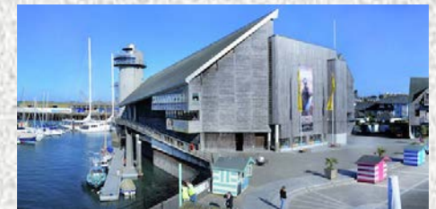
The National Maritime Museum Cornwall

Delegates will have full access to the museum during the conference, with presentations being held in the Sunley Lecture Theatre.